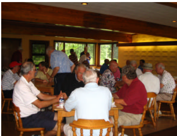
Golfers enjoying a game of cards at the O.F.O. golf outing.