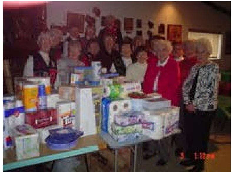
KC Ladies 2009 Christmas Party