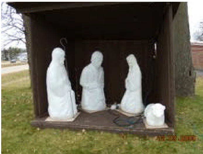
Creche at Knights of Columbus Clubhouse on Verona Road